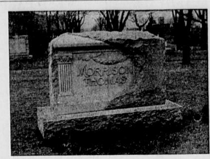
MEMORIALS of MERIT for FIFTY YEARS

OUR FIRST CONSIDERATION has been to satisfy our customers and we accomplish this purpose through OUALITY WORKMANSHIP at REASONABLE PRICES, MEAGHER MEMORIALS are known all over New England as leading symbols of endurance and beauty; each and every MEMORIAL is our own product, designed and manufactured by ourselves and sold to you with a GUARANTEE TO GIVE YOU LASTING SATISFACTION.