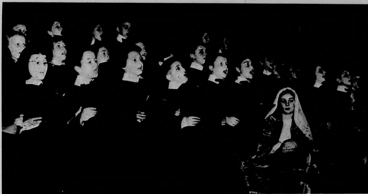
NATIVITY SCENE (top) from the Old-Fashioned Christmas Festival pageant staged in the Memorial Auditorium last Sunday by the choral society of Stowe school. (Below) members of the choral group who won so much praise for their singing.

Talented singers of the school, which comprises fourth to sixth grade pupils, were exceptionally good in their singing and speaking parts and held the attention of the audience as they progressed through the various stages of the scenes which built up to the closing Manger scene. The costumes of the girls in pastel shades, and those of the boys as shepherds in more somber hues, added a colorful backdrop to the presentation.