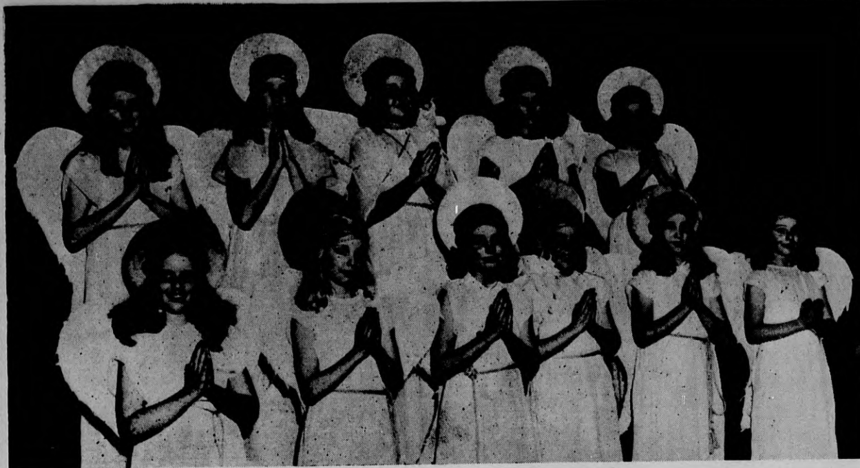
SMILING GROUP OF ANGELS appearing in the pageant presented by the Stowe school choral society at the Memorial auditorium last Sunday to open the Old-Fashioned Christmas Festival program.