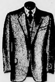
GLEN ARTNEY No excess padding or canvas stiffening. Easy lines.

GLEN ARTNEY by Southwick For the gentleman who knows correct styling and appreci- ates fine clothes.