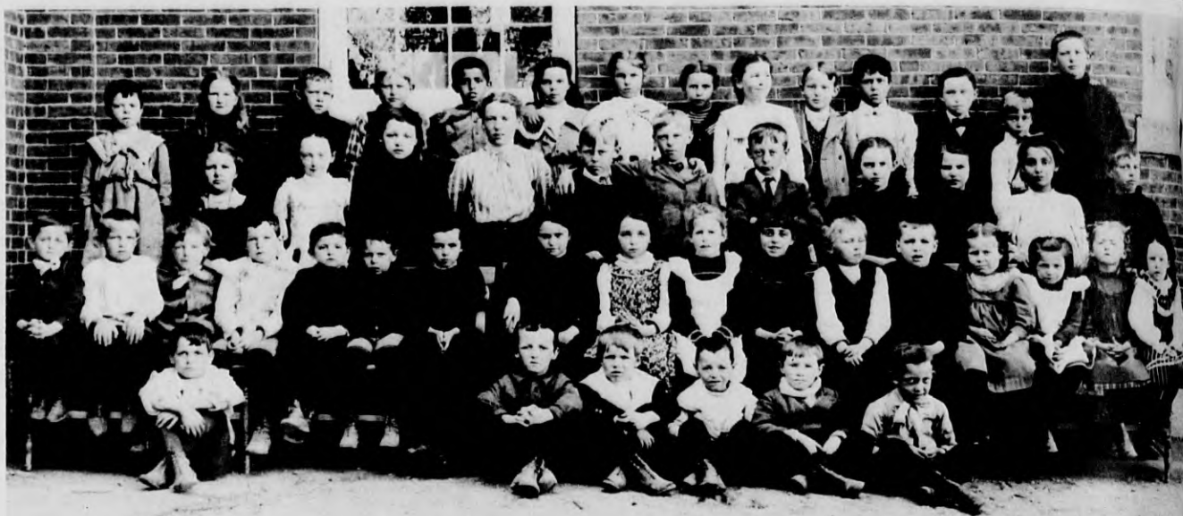
The Richardson school in Shawsheen village, long since abandoned as a school house, at one time had two of its rooms used with four grades in each room. Here is a group of four classes photographed about half a century ago, according to

License #98 2nd Floor — MUSGROVE BLDG ANDOVER SQUARE TEL. ANDOVER 1998