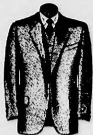
GLEN ARTNEY No excess padding or canvas stiffening. Easy lines.

GLEN ARTNEY by Southwick For the gentleman who knows correct styling and appreciates fine clothes.