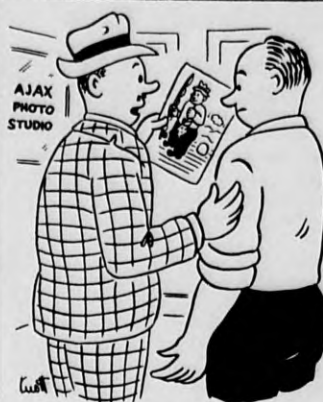
"No! No! Don't enlarge me - just the fish."

Inventory Time It's a good time to take inventory of your insurance. Let us tell you about our Plandex which shows you at a glance, your whole insurance program.