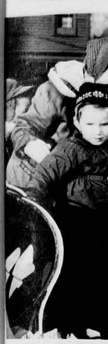
SANTA AND THE kids of the Fire Dept. ride down Main st. on plus cheery words f