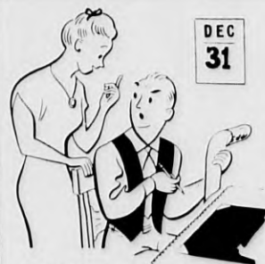
"And take the family out to dinner once a week."

QUICK, EXPERT SERVICE CITY GLASS CO. 73 Valley St., Tel. MU 3-3675 Lawrence, Mass