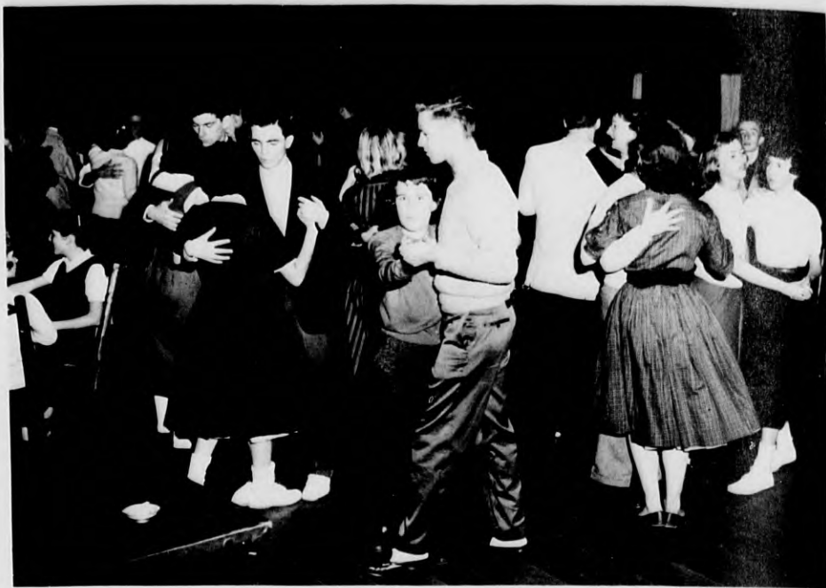
PRE-CHRISTMAS PARTY - Members of the Christian Doctrine Class of St. Augustine's Church held a pre-Christmas dance and party at the Log Cabin.

For the convenience of our patrons, payments may be made in Andover at the Merrimack Valley National Bank.