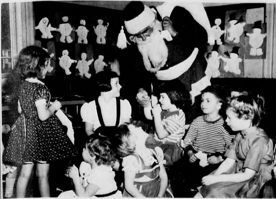
SANTA MAKES A HIT - Kingergarten youngsters at the Bradlee School enjoyed Santa Claus' visit during Christmas parties held in the various classes.