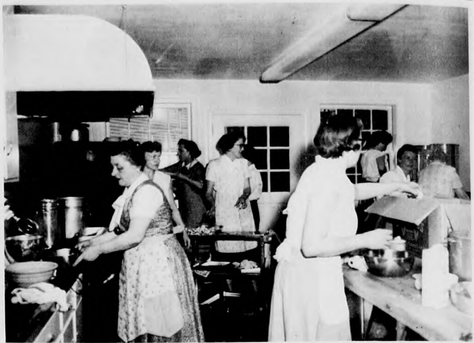
HARD WORKERS - Turning out scrambled eggs and ham, plus homemade muffins and doughnuts, for hungry breakfasters last Saturday were these West Parish Church women. The kitchen was a beehive of activity from 7-10 a.m., during the annual May Breakfast.

MOTO MOWERS from $69 95 and up Find out how easy lawn mowing can be how easy it is to own a sensational new Moto-Mower! PAY AS LITTLE AS 5.00 A WEEK COME IN FOR A DEMONSTRATION NOW! You Can Charge It or Budget At COLE Paint & Hardware 10 MAIN STREET TEL. 1156 AUTHORIZED MOTO-MOWER DEALER