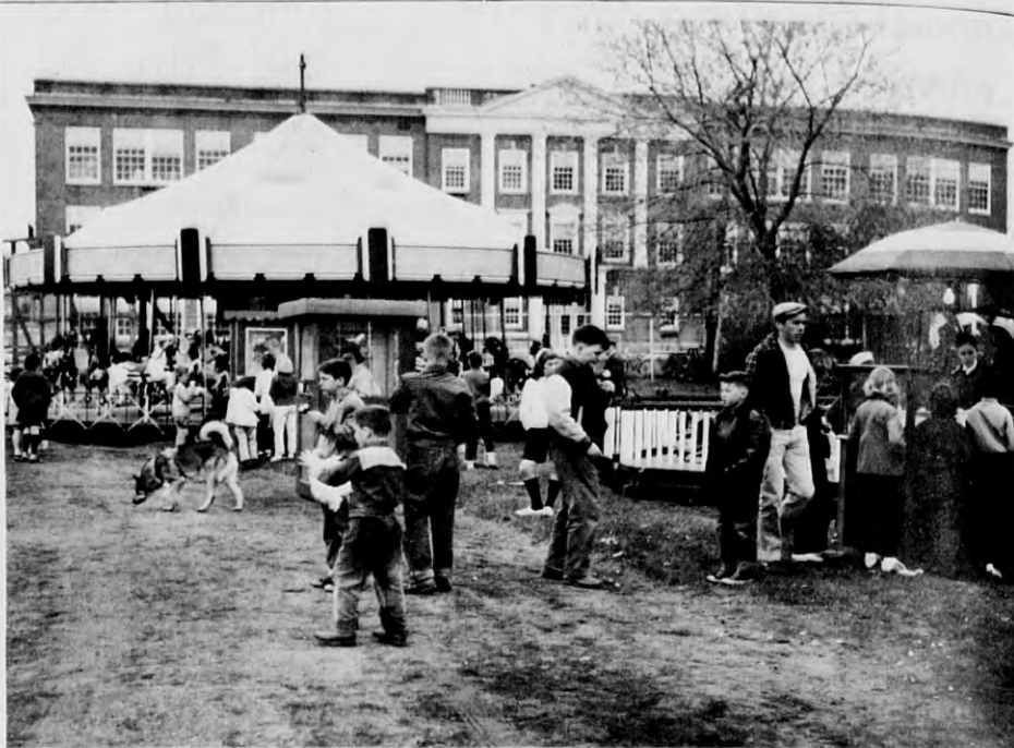
DESPITE CLOUDY WEATHER - Clown Town last Saturday got off to a good start, although the skies were threatening. Later in the day it rained hard, but a sizeable crowd enjoyed the Andover Society's annual event, which helps support the Youth Center. This photo was taken shortly after the affair opened.