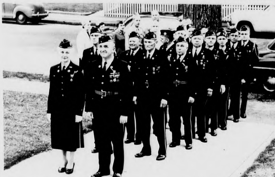
ATTENDING CHURCH SERVICES - Members of all veterans organizations and their auxiliaries attended traditional memorial services Sunday at the Free Christian Church.