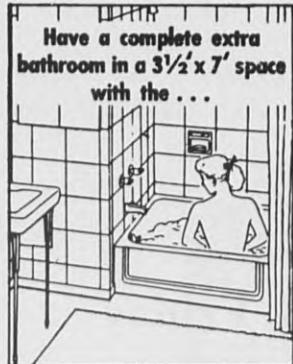
RESTAL Receptor Bath by AMERICAN-Standard