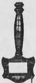
Letter memo Rack—slots on handle holds 5 letters, 6 key hooks, memo pad, inlaid cork panel with stick pins. 9 1/2" wide, 21" high.