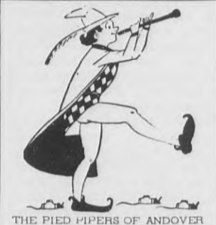
THE PIED PIPERS OF ANDOVER