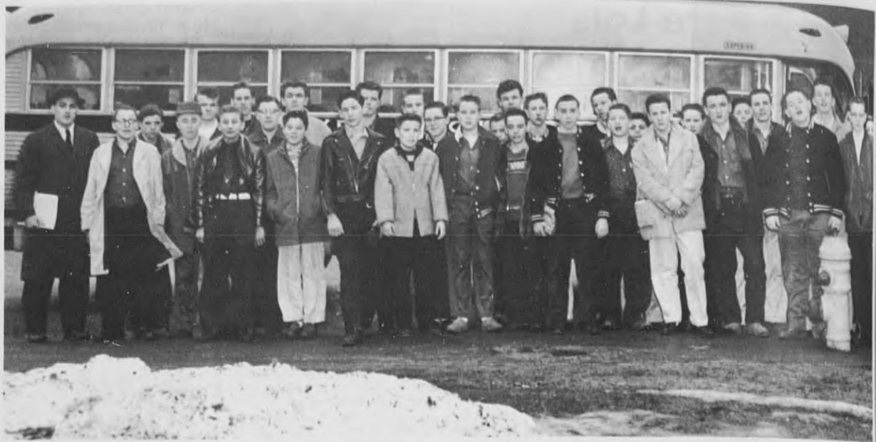
TRIP TO ESSEX AGGIE - Andover Junior High students recently took a trip to the Essex County Agricultural School, where they toured the facilities and found out what the school