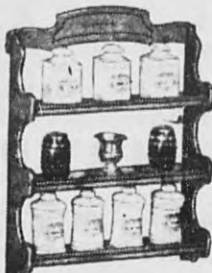
"Easy-Access" Spice Rack—keeps spices neat and in full view for quick selection. 15 1/4" wide, 3 1/2" deep, 19 1/4" high.