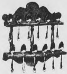
Spoon Rack—Add a sparkling touch to your dining area. 14 1/4" wide, 4 1/2" deep, 13" high.