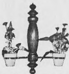
Wall Planter with brass trim—Plant your walls and bring the outside in. 16" wide, 6" deep, 19" high.