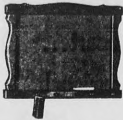
Blackboard—complete with eraser and chalk. 4 key hooks, inlaid cork panel with stick pins. 19" wide, 14 1/2" high.

Attractive, functional accessories with the mellow tones of hand rubbed maple. A decorator's delight that will add warmth to any room, beautify your walls and compliment your finest furniture.