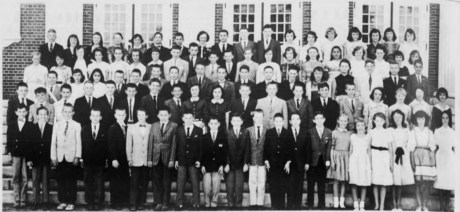
GRADUATING CLASS AT CENTRAL - The sixth graders at Central School the steps of Memorial Auditorium will go on to Junior High next September. Here, the class members pose on