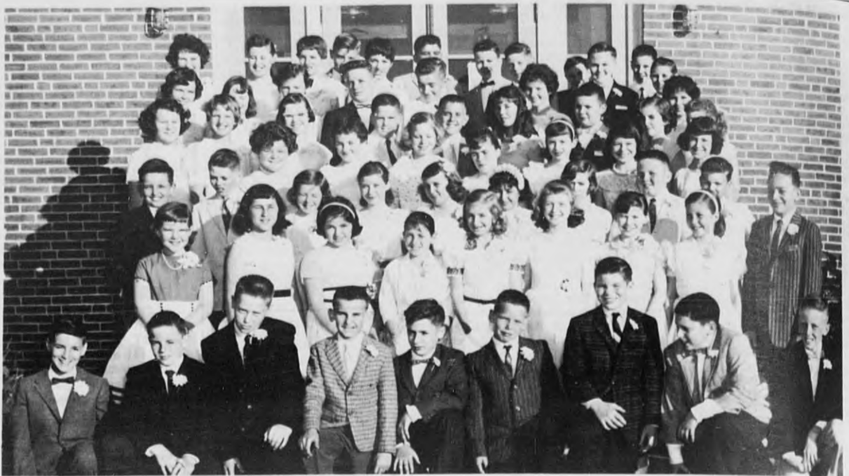
SIXTH GRADERS FETED - The PTA at the West School had a party for sixth graders, who go on to Junior High next fall. The 68 class members enjoyed the occasion, and entertainment

Dine at our beautiful THEATER TERRACE RESTAURANT Delicious Food! Cocktails - Mixed Drinks Buffet Dinner $3.25 Open Nightly - 5 P.M. to Midnight NOW PLAYING - LAST 6 TIMES CELESTE HOLM Cathleen Nesbitt Sandor Szabo in "Royal Enclosure"