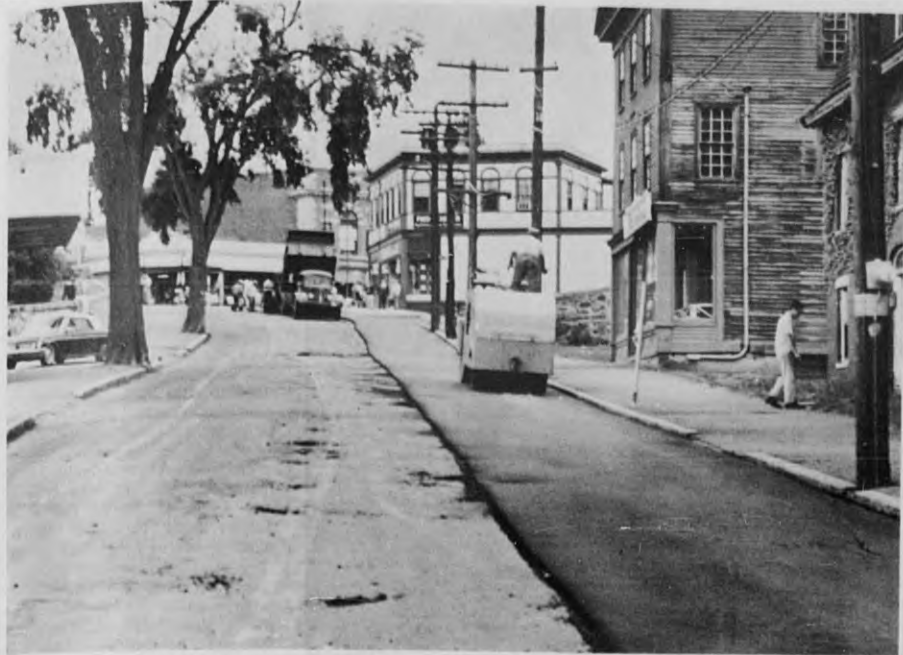
RESURFACING of Essex st. was done early this week. Modern equipment made short work of the job which was started Monday afternoon and completed Tuesday morning. Layer of hot top is shown at right where roller is packing material. At top of hill, trucks and workmen are shown as they placed a second strip on the street. (Staff Photo)