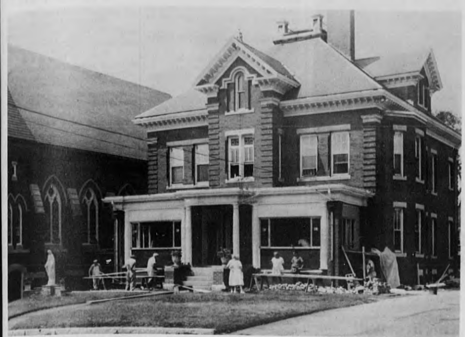
ST. AUGUSTINE'S RECTORY at 43 Essex st. is taking on a new look as workmen carry out renovations. Parishioners look on as tradesmen go about changing over the front of the priests' home.