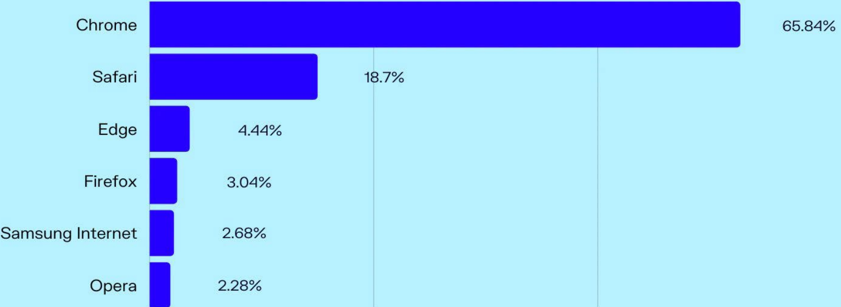
Most Popular Browsers in 2022